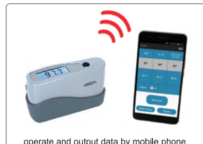
operate and output data by mobile phone connect to mobile phone via Bluetooth (only Android system)