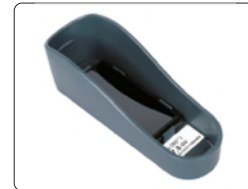
base with calibration block (included)