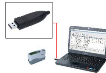
connect to computer via Bluetooth